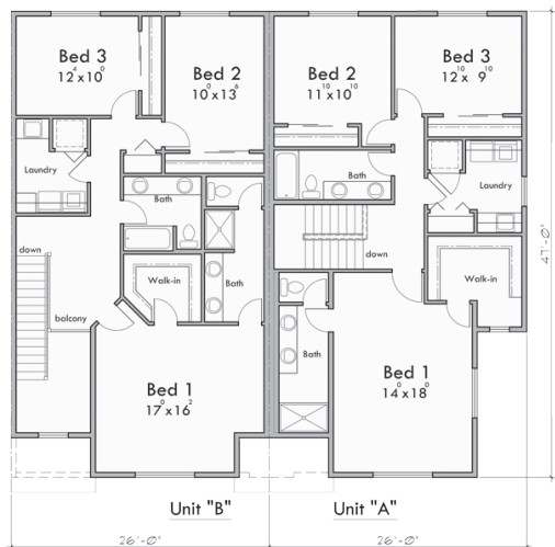
upper floor (right set of units)